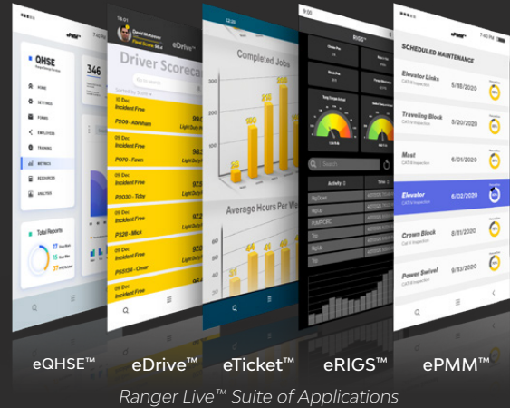
Ranger Live™ Suite of Applications

The Ranger Live mobile platform is a customized suite of applications our field crews use at the job site via tablet. The suite includes eQHSE™ safety and quality system, eDrive™ vehicle tracking and driver behavior management system, eTicket™ electronic ticketing system, eRIGS™ Real time Data Acquisition system and cloud monitoring and ePMM™ preventive maintenance management system. Data is transmitted to the cloud, stored on Ranger’s sequel server database, and accessible via a laptop, tablet or smartphone.