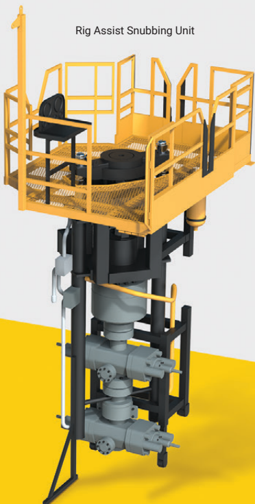
Rig Assist Snubbing Unit